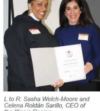
the Illinois Region

employee, was at her gym preparing to work out when she noticed a circle of people surrounding a man who had collapsed on the floor. She assessed the situation and determined that the man was not breathing and didn't have a pulse, so she began compressions immediately.